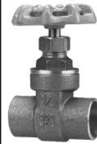
BRASS GATE VALVE, SWEAT