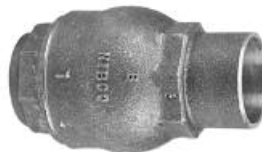
BRONZE SPRING LOADED CHECK VALVE, SWEAT

3/8" & 1/2" : 1-1/2 POUNDS TO OPEN. 3/4" - 2" : 1/2 POUND TO OPEN.