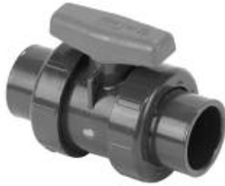
TRUE UNION BALL VALVE GRAY — PVC