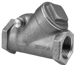
BRONZE SWING CHECK VALVE THREADED, DOMESTIC