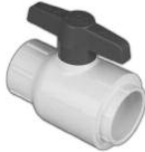
COMPACT BALL VALVE WHITE — PVC