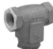
BRONZE "V" STRAINER, THREADED