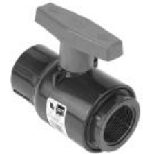
COMPACT BALL VALVE GRAY — PVC