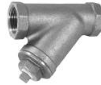
BRONZE WYE STRAINER, THREADED