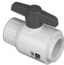
COMPACT BALL VALVE WHITE — PVC