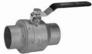
BRASS BALL VALVE SWEAT – FULL PORT