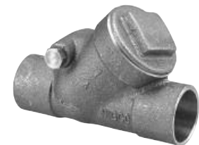
BRONZE SWING CHECK VALVE SWEAT, DOMESTIC