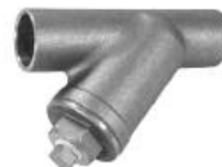
BRONZE WYE STRAINER, SWEAT