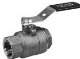
BRONZE BALL VALVE THREADED – FULL PORT DOMESTIC