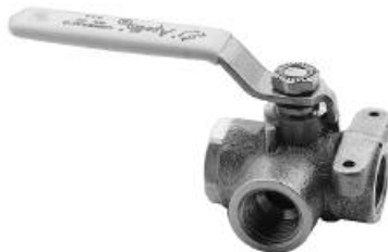
BRONZE BALL VALVE 3-WAY 400# CWP