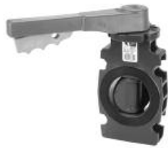
PVC BUTTERFLY VALVE LEVER HANDLE