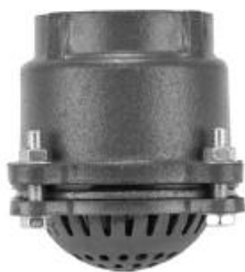
IRON FOOT CHECK VALVE WITH STRAINER