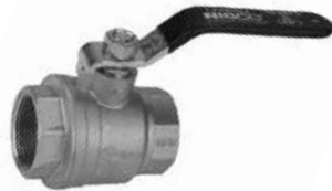
BRASS BALL VALVE THREADED – FULL PORT