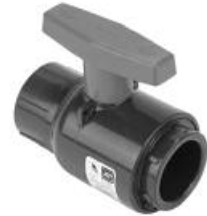
COMPACT BALL VALVE GRAY — PVC