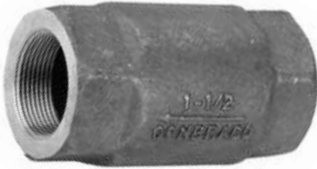
APOLLO® BRONZE BALL CONE® SPRING LOADED CHECK VALVE, THREADED