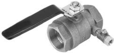
BRASS BALL VALVE TAPPED FOR TEST COCK