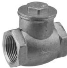
BRASS SWING CHECK VALVE THREADED, 200# CWP