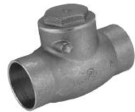
BRASS SWING CHECK VALVE SWEAT, 200# CWP