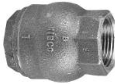
BRONZE SPRING LOADED CHECK VALVE, THREADED