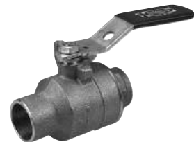
BRONZE BALL VALVE SWEAT – FULL PORT DOMESTIC