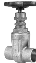
BRONZE GATE VALVE, SWEAT