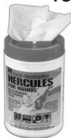
PRE- MOISTENED TOWELS