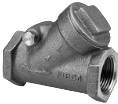
BRONZE SWING CHECK VALVE THREADED, DOMESTIC