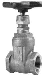
BRONZE GATE VALVE, THREADED