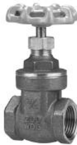
BRASS GATE VALVE, THREADED