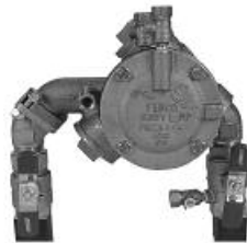
FEBCO #825YA ANGLE PATTERN