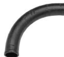
90° 1/4 BEND LONG SWEEP