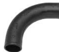
90° 1/4 BEND MEDIUM (SHORT)