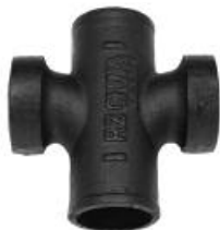
TAPPED SANITARY CROSS