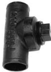
TAPPED CLEAN-OUT TEST TEE