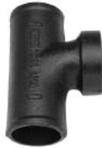
TAPPED SANITARY TEE