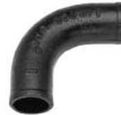
90° 1/4 BEND VENT