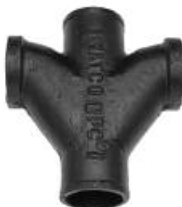
FIGURE #1 (TAPPED)